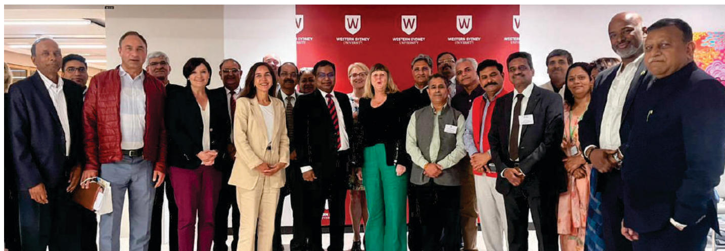
Visit of Western Sydney University